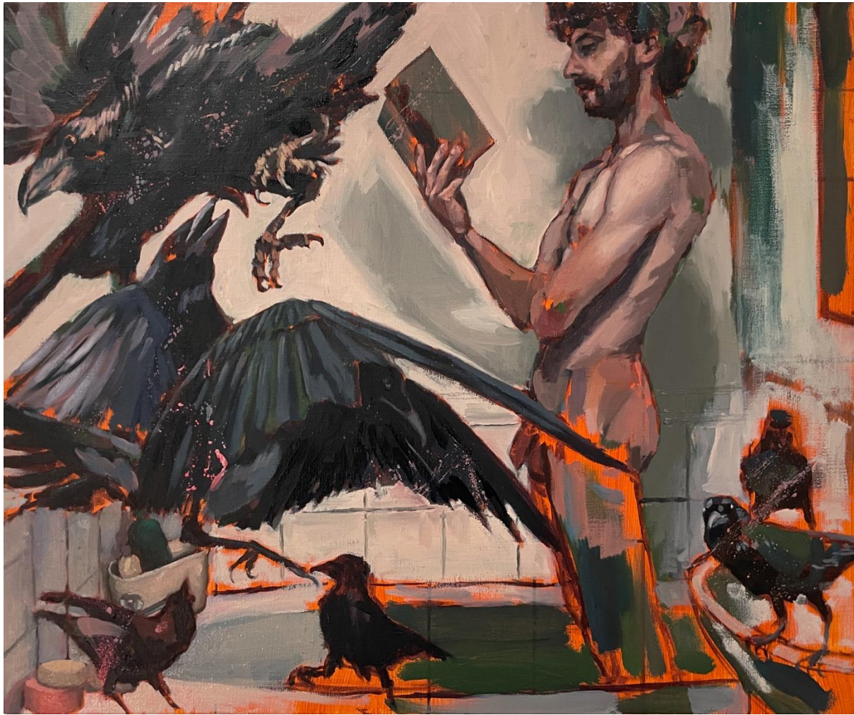
Black Spring , oil on linen, 60 x 50 cm, 2025