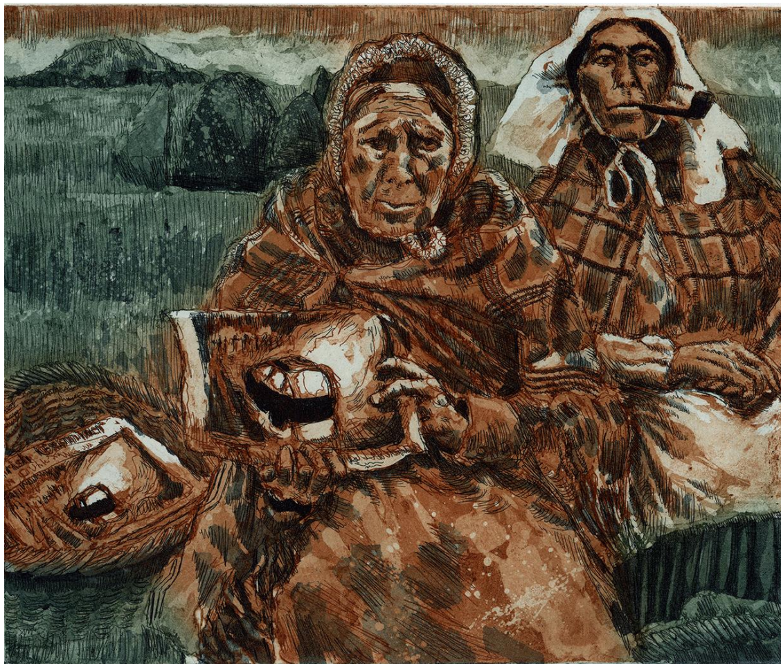
A certain critical period #1 , two-plate etching with aquatint, 21 x 18 cm (image), 2025