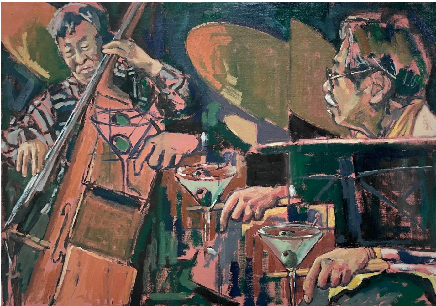
Mr. Kenny's olives , oil on linen, 100 x 70 cm, 2025