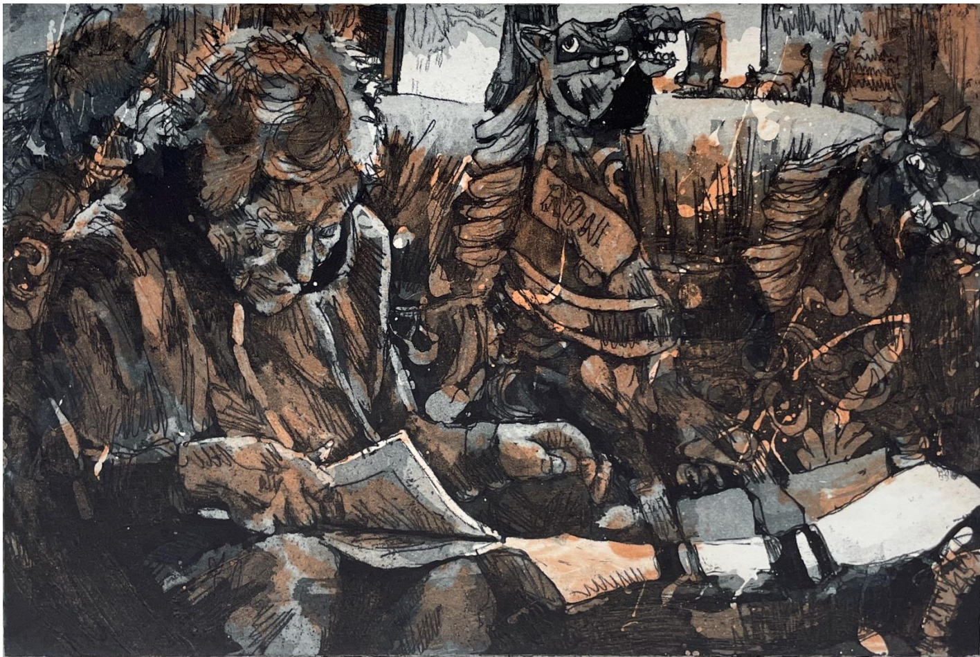
Watching Dublin/Bloody Horror, etching and carborundum, 30 x 20 cm (image), 2024