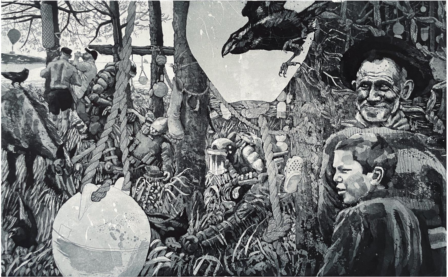
A Cill Rialaig Story , etching with aquatint, 80 x 50 cm (image), 90 x 60 cm (paper), 2026