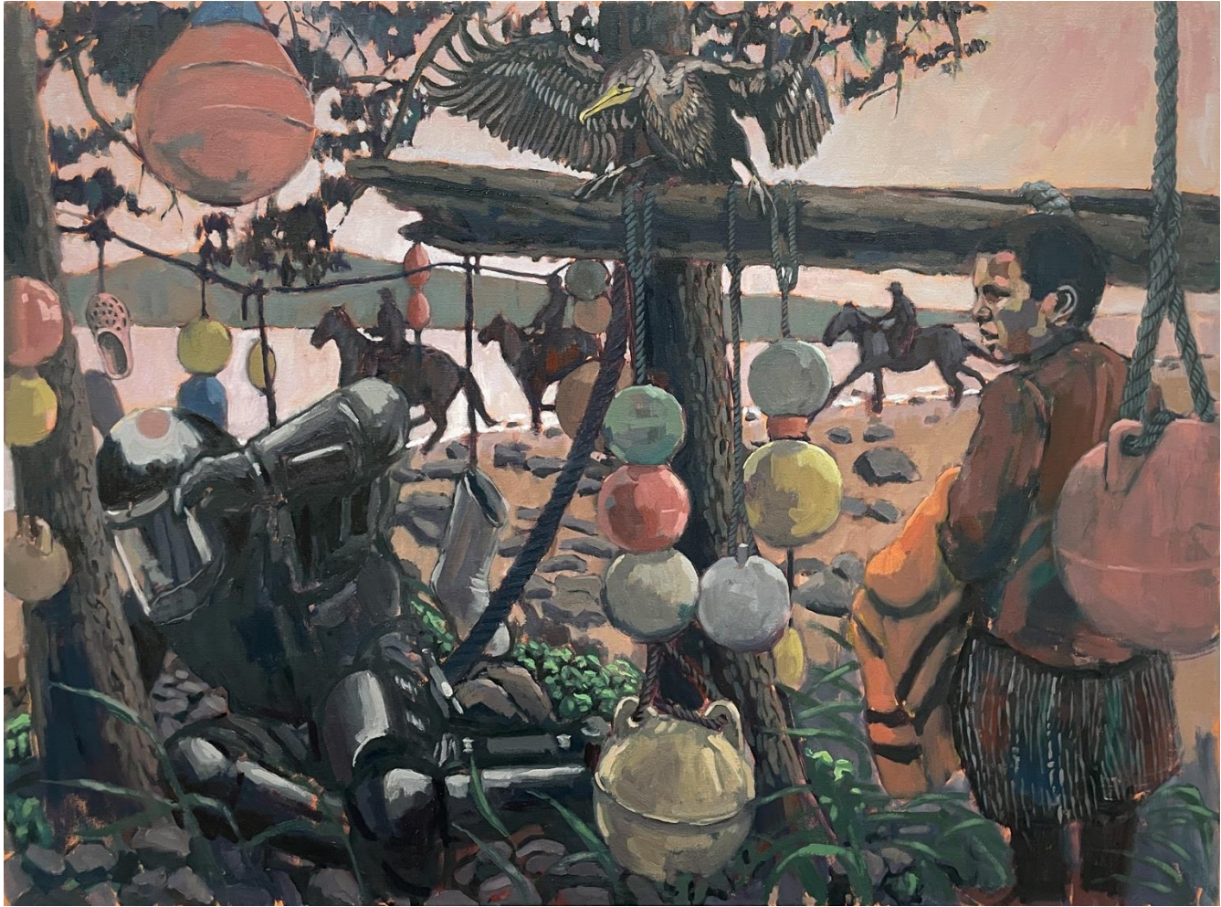
If you were eight, near-sighted, and nostalgic for places you've never been, oil on canvas, 100 x 70 cm, 2025