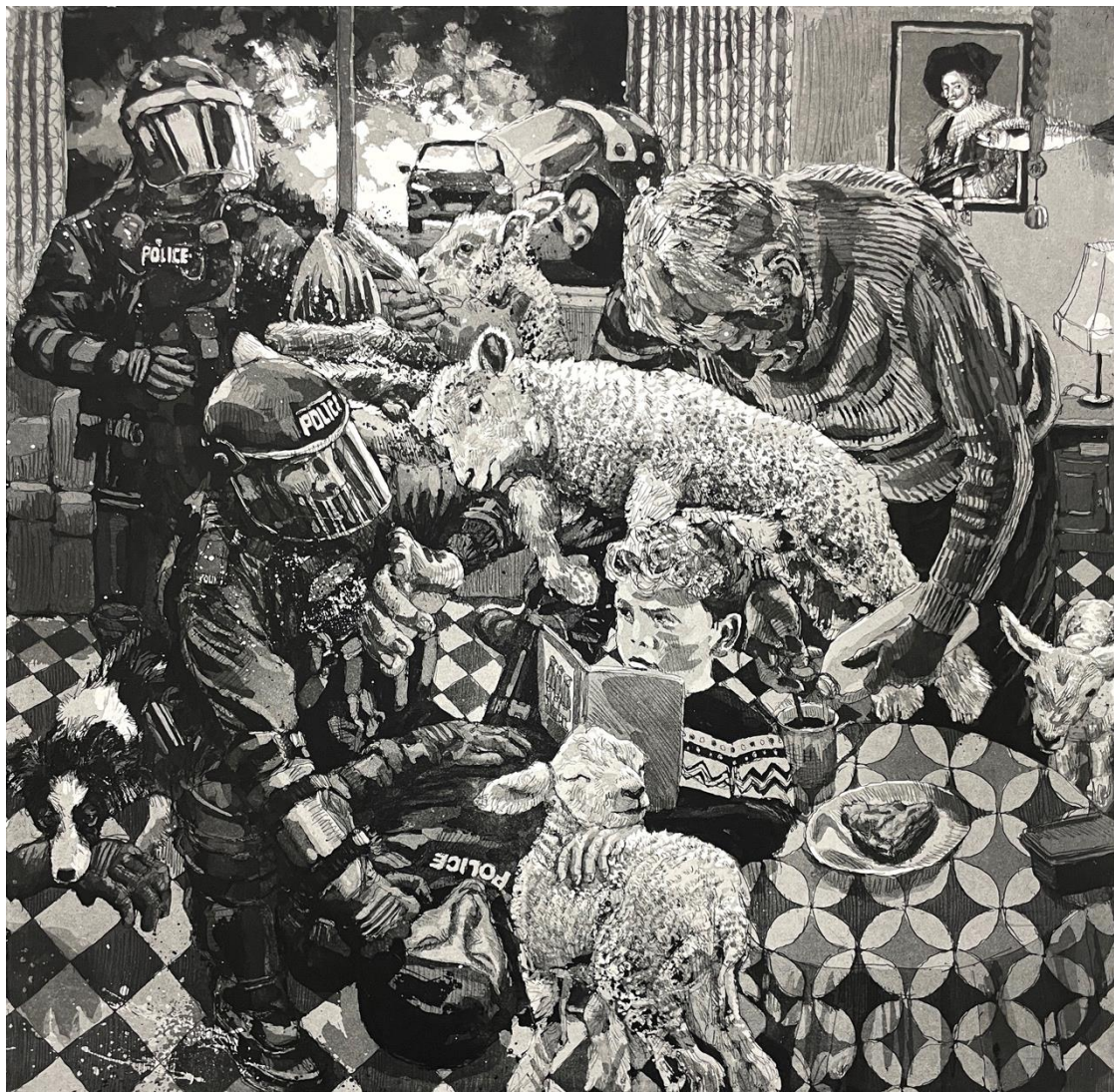
Someone's Firebombed McQuaid's Pharmacy Etching with aquatint, 60 x 61 cm (image), 66 x 68 cm (paper) 2026