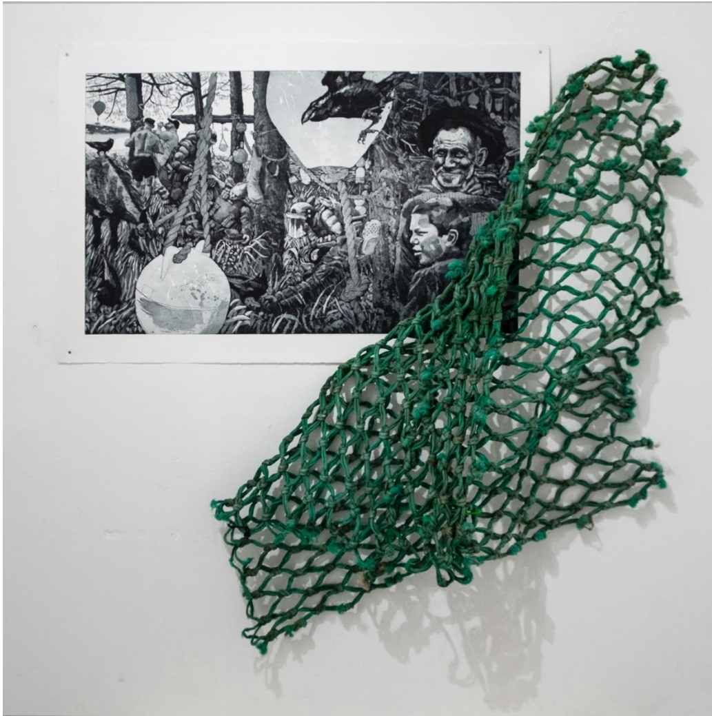
A Cill Rialaig Story , installation view at OUT: St. Leonards, etching with aquatint, found netting, 80 x 50 cm (image), 90 x 60 cm (paper), 2026