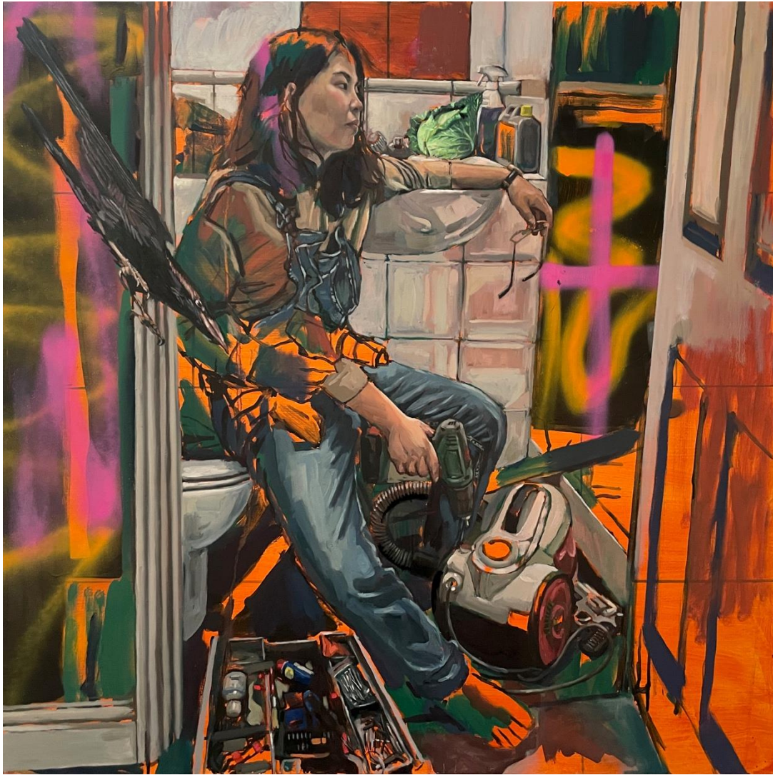
Mission Creep , oil on canvas, 100x100cm, 2025.