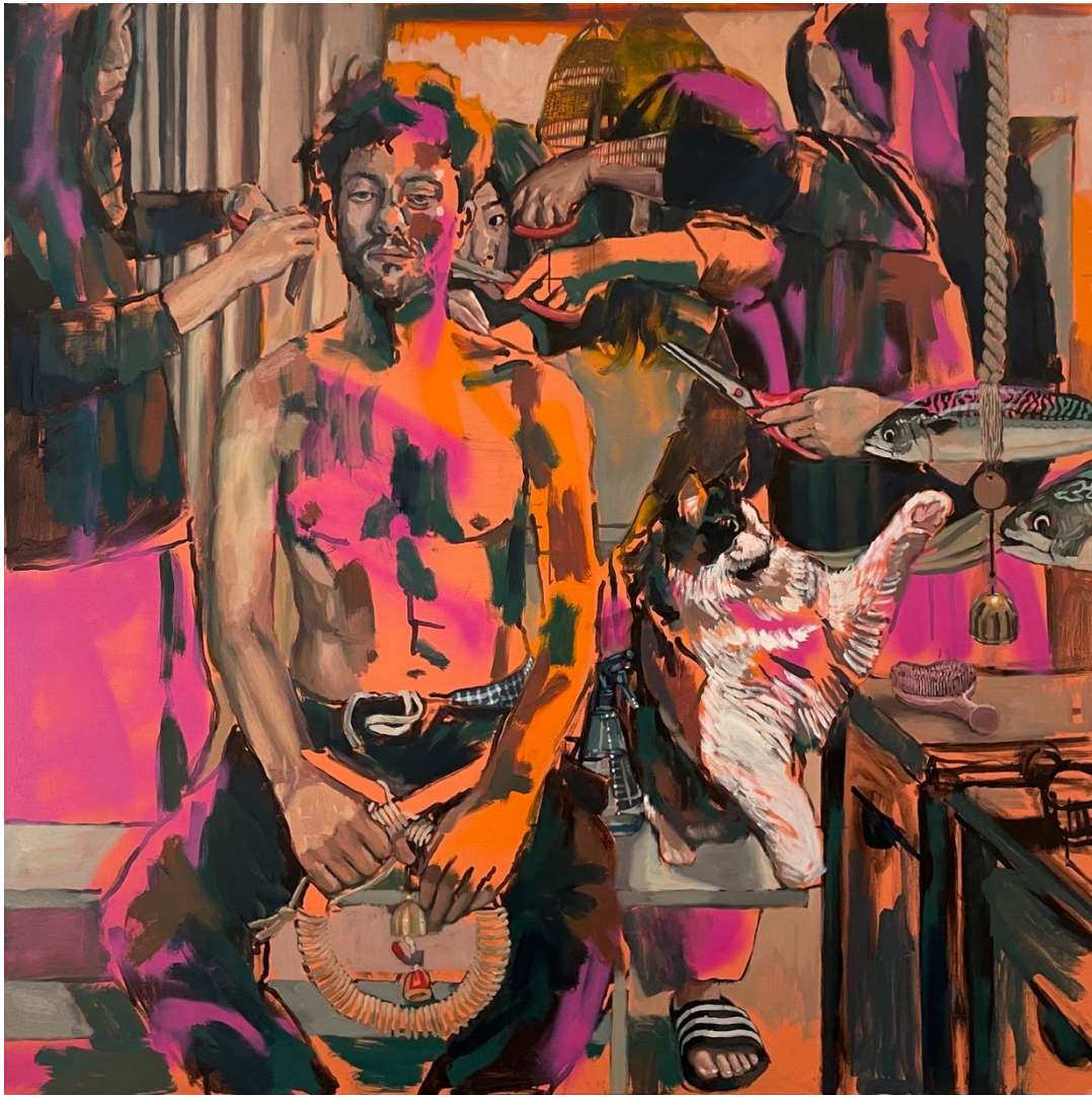
Marriage, a work in progress, oil on canvas, 100x100cm, 2025.