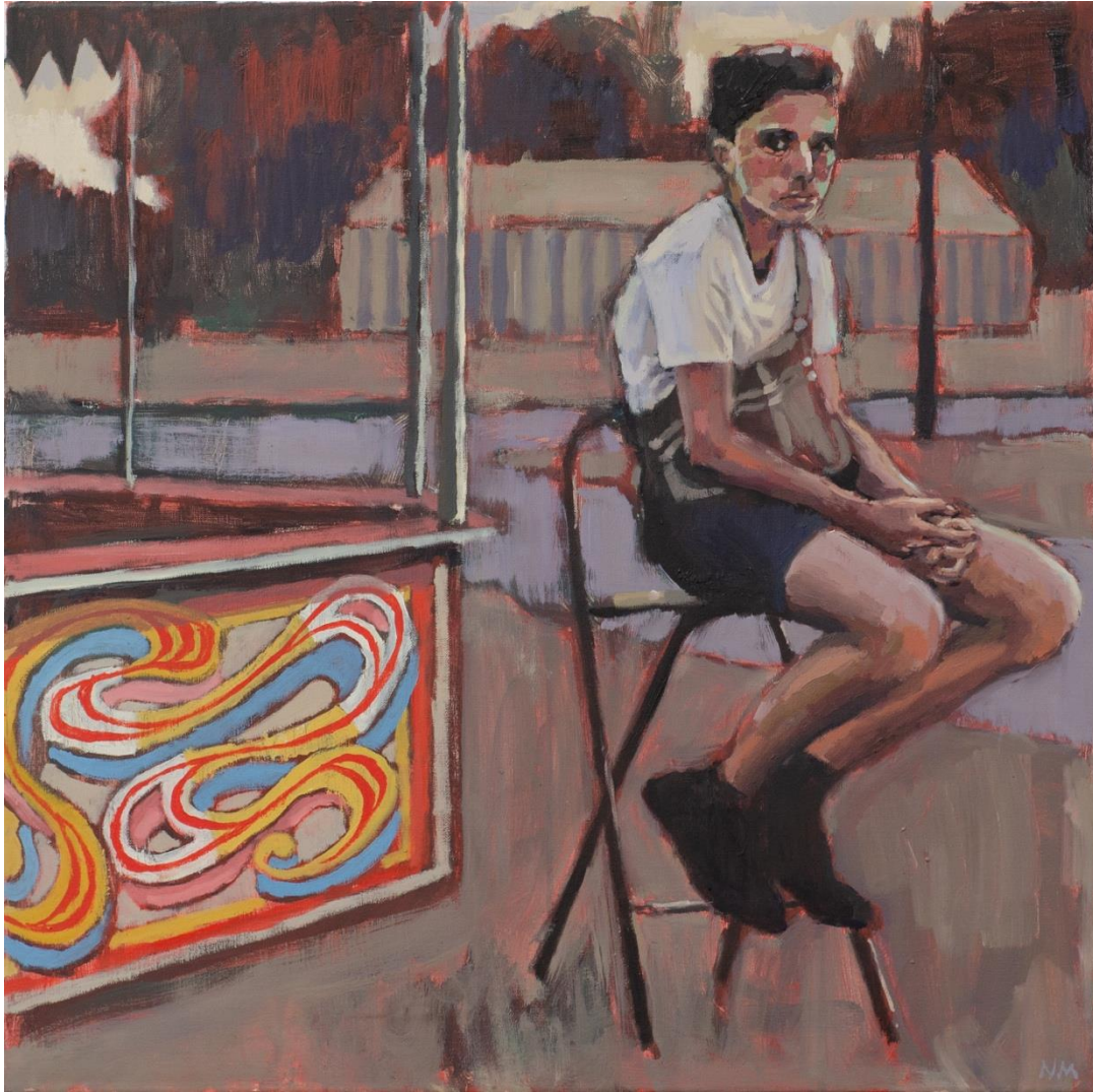
At the Midsummer Fair, oil on linen, 50 x 50 cm, 2024. Shortlisted for the Ingram Prize 2024.