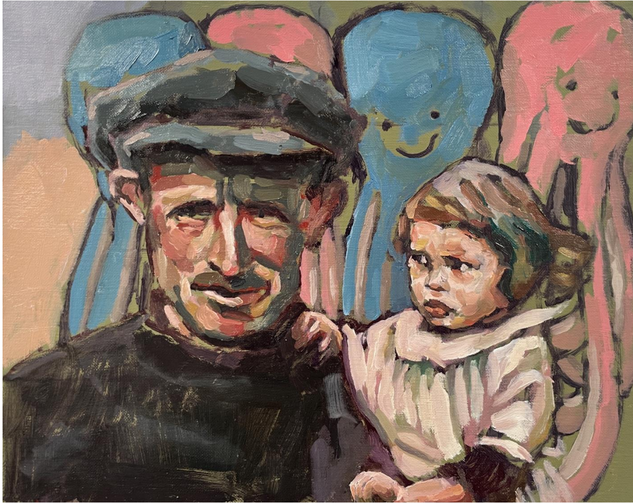
One more day , oil on linen, 30 x 24 cm, 2025