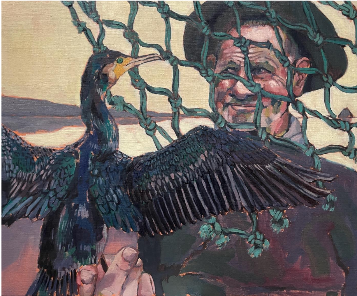
A Confession , oil on canvas, 60 x 50 cm, 2025