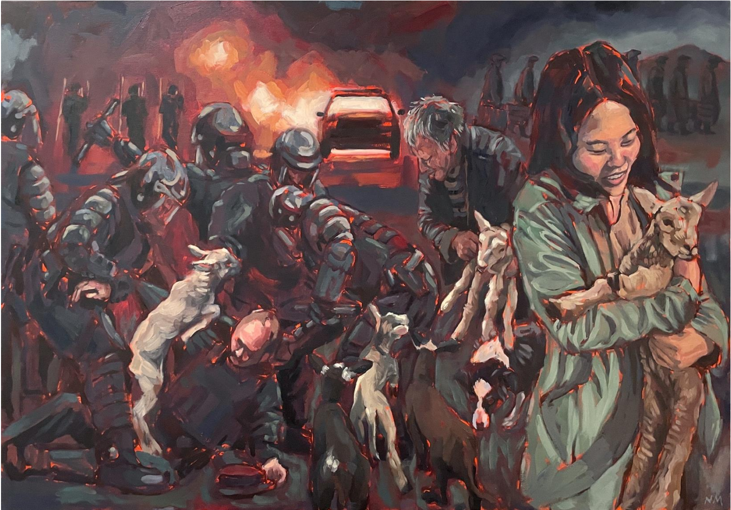
Island of Strangers , oil on canvas, 100 x 70 cm, 2025