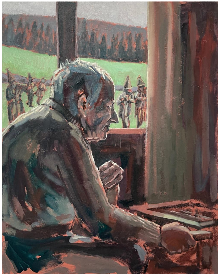
They Used to Come Here , oil on linen, 60 x 75 cm, 2025