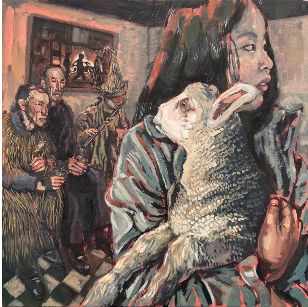
Sheltering a small remaining trace of fire through a dark period, oil on linen, 60x60cm, 2025.