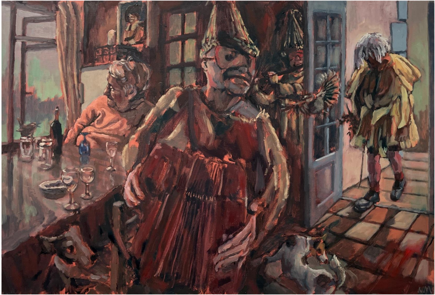
The Wren Boys at Wendy's , oil on linen, 75 x 50 cm, 2025